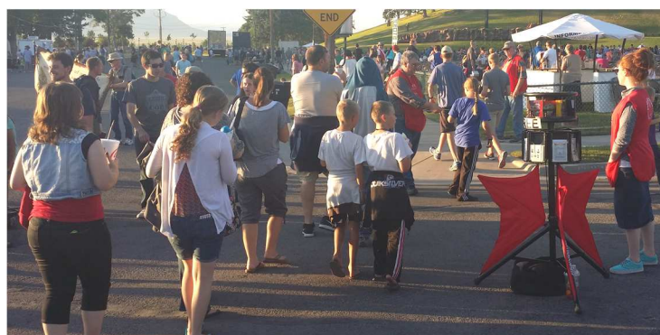
Manti, UT Evangelism to LDS (Mormons)