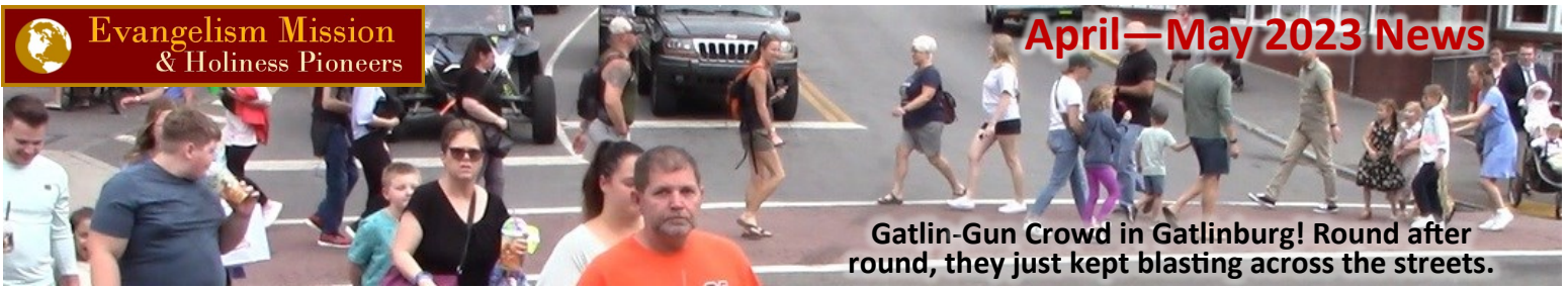
Gatlin-Gun Crowd in Gatlinburg! Round after round, they just kept blasting across the streets.