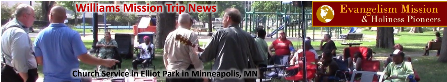
Church Service in Elliot Park in Minneapolis, MN