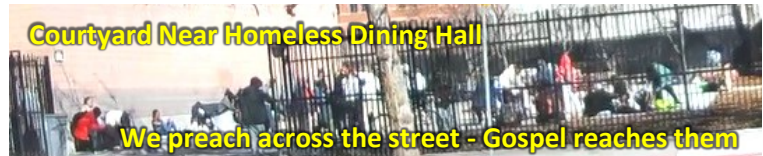
Courtyard Near Homeless Dining Hall

I returned to Salt Lake City in early February and resumed the normal of street evangelism, preaching at the rescue mission, in parks, and at the library conference room. We also started doing street meetings near a homeless dining hall and yard where